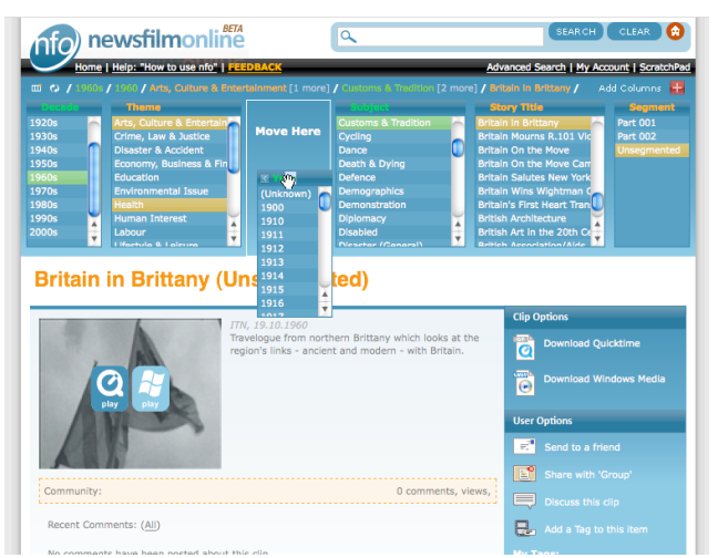
Figure 2. The mSpace explorer in NewsFilmOnline.

Another behaviour from the investigation with macro-level use was the emphasis that users put on social interactions to support exploratory search. One example that was regularly given by the known participants is that they wanted to know what other people were doing, in particular what their peers, or experts in their field,