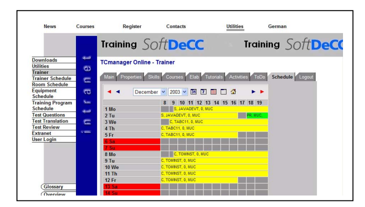
Fig. 2 Trainer Schedule obtained via authenticated access