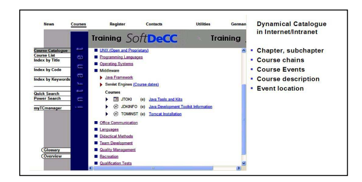
Fig. 1 Integrated internet catalogue

An integrated administration example is TCmanager , a seminar administration system with integrated eLearning platform implementing SCORM<sup>TM</sup> 1.2 runtime. It provides efficient operational support for the delivery of training and in order to minimize administrative efforts, collect feedback from eLearning programs and therefore make eLearning a profitable business. For students the first visible result is the integrated training catalogue including both classroom training and WBT offerings.