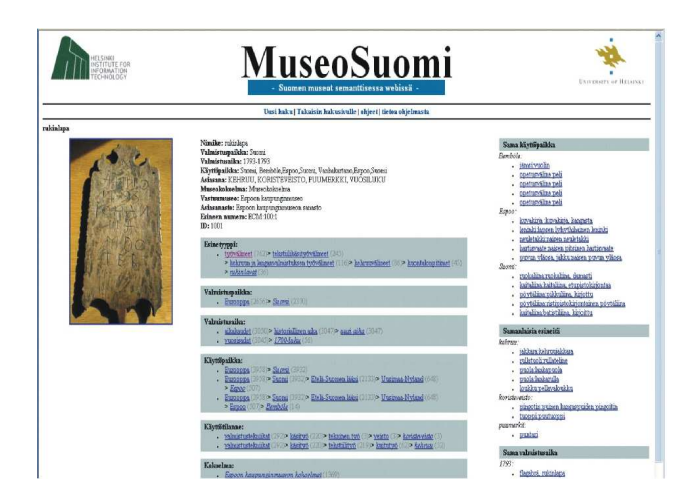
Figure 1: A collection object web page.

other. The linkage is shown to the end-user as hypertext links. The links are defined declaratively in terms of Prolog predicates. Each predicate defines a semantic association and gives it a label as an explanatory name for the link.